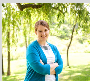
Delphine Keupfer Pharmacy/Clinic